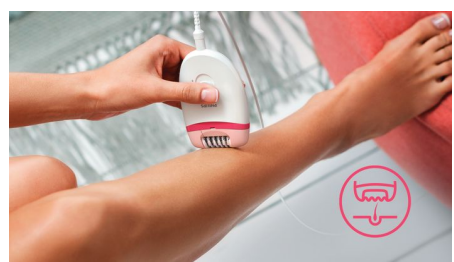
Efficient epilation system leaves your skin smooth and stubble free for weeks